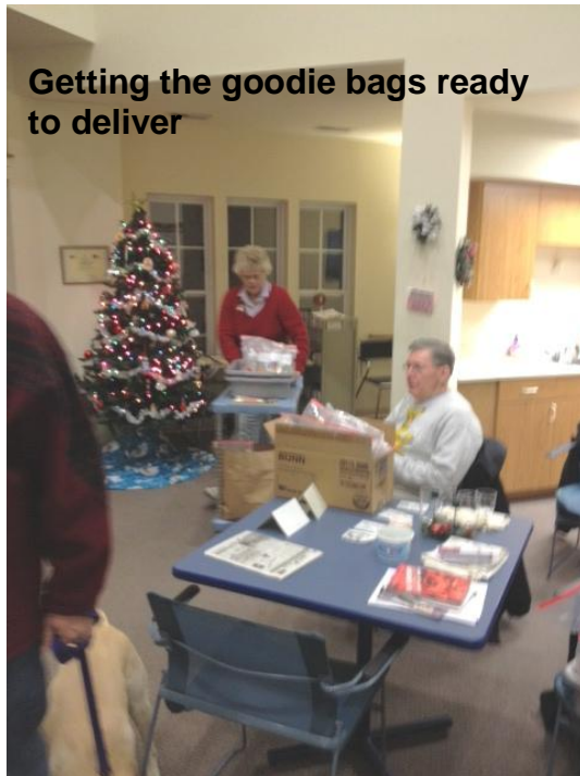
Getting the goody bags ready to deliver