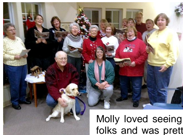
Molly loved seeing all the folks and was pretty good when she saw another dog and a kitty!